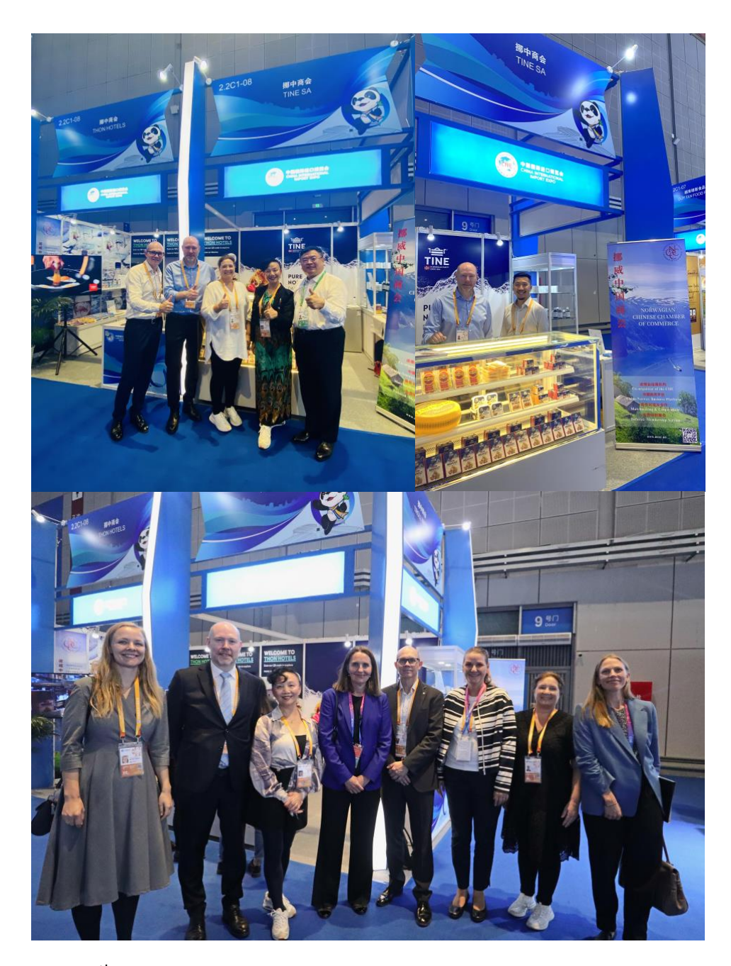
6<sup>th</sup> CIIE – China International Import Expo in Shanghai