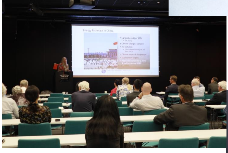
NCCC Annual General Meeting 20.09.23 at NIO House

CHINA and The Global Supply Chain Regulations, Politics and Solutions